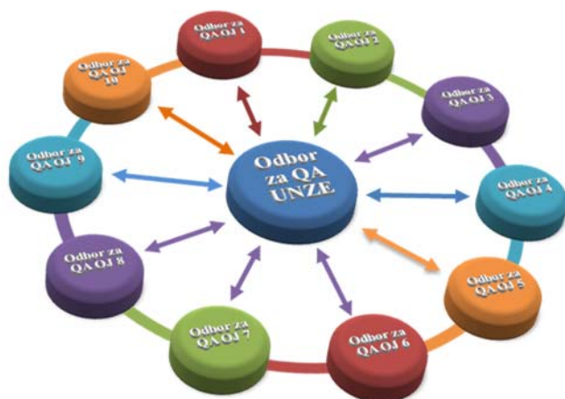
Slika 1. Strukturalna šema sistema osiguranja kvaliteta Univerziteta Figure 1. Structural scheme of the quality assurance system at the University